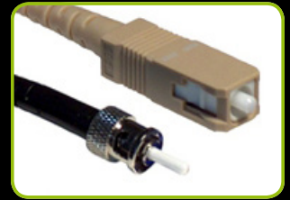
SC (Top) and ST